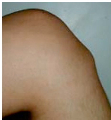
Patient may have prominence at tibial tubercle.

Initial treatment includes rest, ice and non-steroidal anti-inflammatory drugs (NSAIDs). Often that is sufficient. However, if unresolved, the pain associated with Osgood-Schlatter disease can last for months. Some patients will experience recurrences for several years until they have reached skeletal maturity. Physical therapy that focuses on stretching the hamstrings and strengthening and stretching the quadriceps can be helpful for patients who experience recurrences. Occasionally, people who have recurrent episodes of Osgood-Schlatter disease will develop a knobby looking knee that will remain in adulthood.