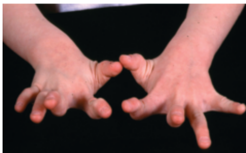
Fig. 1 - A classic example of finger joint hypermobility

Joint hypermobility is a condition in which a person's joints can be flexed beyond the normal range of motion. It affects approximately 10 to 15 percent of children. 1 The diagnosis often appears straightforward—excessive laxity in finger (Fig. 1), elbow, hip and knee joints—and often it is that simple. If there are no other associated symptoms, joint hypermobility is usually considered benign.