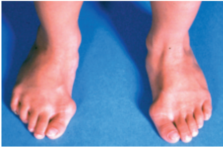
Fig. 2 - Bunions and flat feet in a nine-year-old boy

At Gillette Children's Specialty Healthcare, we use the Beighton scale to screen for joint hypermobility. The scale assesses only a few joints and is based on four passive maneuvers and one active maneuver. Instead of focusing on the degree of hypermobility at a particular joint, the tool helps clinicians establish how widespread the hypermobility is in that individual. A score of five or more defines generalized joint hypermobility.