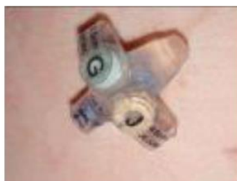
AMT MiniONE GJ button