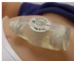
Avanos Mickey GJ Button