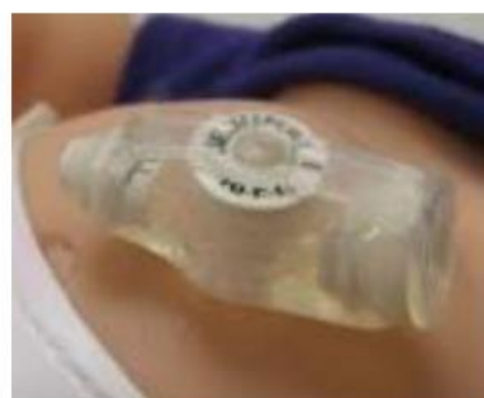
Avanos Mickey GJ Button

This information is for educational purposes only. It is not intended to replace the advice of your health care providers. If you have any questions, talk with your doctor or others on your health care team.