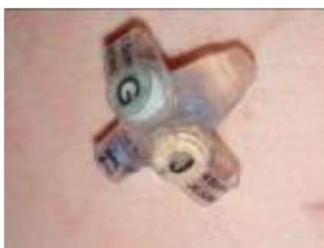
AMT MiniONE GJ button